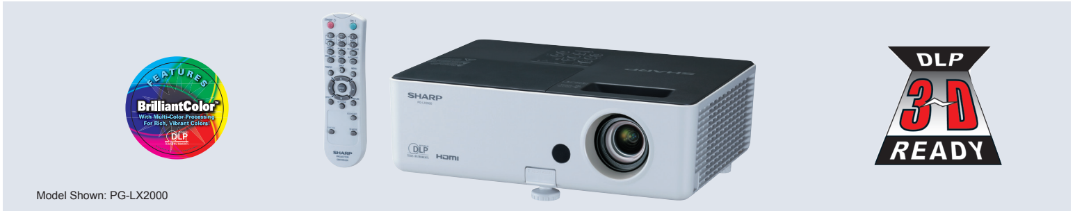
Model Shown: PG-LX2000

Portable and affordable, these 3D Ready BrilliantColor™ DLP® projectors deliver high image quality and superb reliability for classroom, meeting room and small office use. With 2,800 lumens and 2,000:1 contrast ratio, these models provide exceptionally vibrant and realistic image reproduction. The sealed DLP chip with filter-free design helps ensure low maintenance and operating costs. Built in an ISO 14001 certified factory with standby power consumption as low as 0.5W and estimated lamp life of up to 5,000 hours (in eco mode), these lightweight RoHS compatible projectors are an environmentally conscious choice.